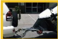
EXTENDED DRAW BAR