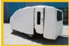
FULL COVER WITH ACCESS