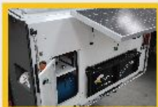
SOLAR & BATTERY UPGRADE