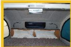
QUEEN BED INNERSPRING MATTRESS