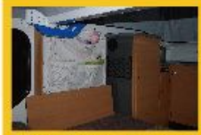
SOFT STORAGE SIDE POCKETS